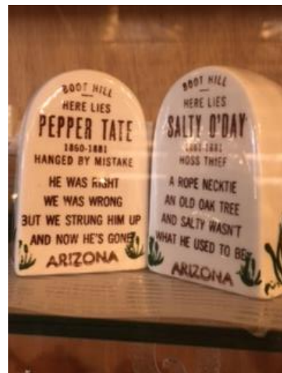
Someone had a sense of humor.