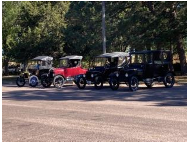
The cars at Fort Kearny.