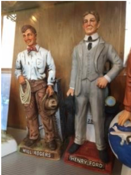
Henry Ford hangs out in Minden.

Please enjoy some pictures from the club tour to Minden and Kearney in October. First 4 pictures are from the Pioneer Museum in Minden, the other pictures were taken at Fort Kearny.